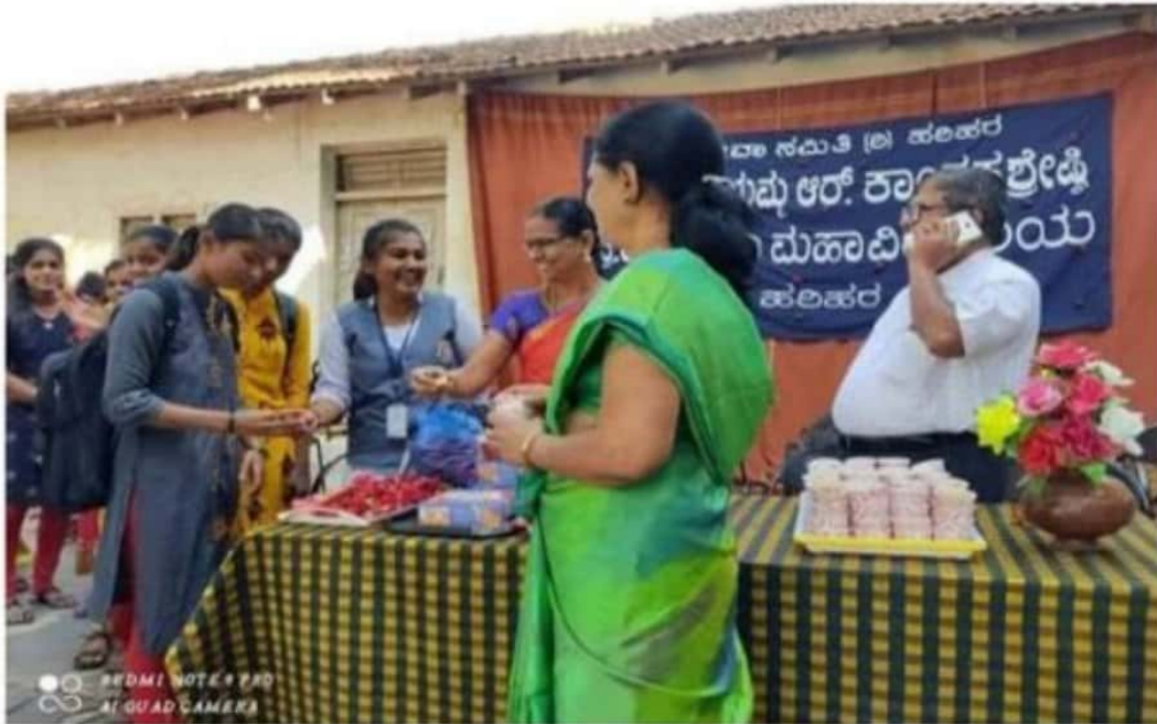
Welcome To I Year Students By Giving Flowers And Sweets