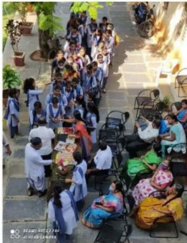
Students gathered in Orientation Programme